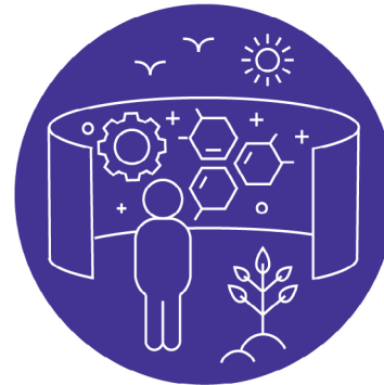
Sustainable, responsible and virtual-assisted teaching and events