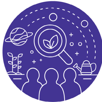
Community-wide participation in developing new solutions and models