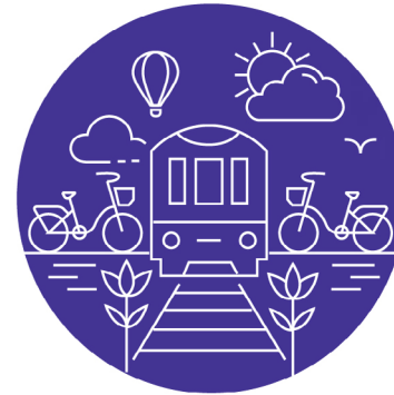
Sustainable travel by staff, students and partners