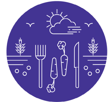
Sustainable and climate neutral food services