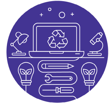
Sustainable, climate friendly procurement and product lifecycle management