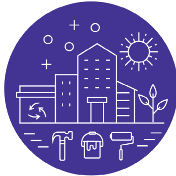
Energy- and resource-efficient campus buildings; monitoring, repairs and maintenance activities support carbon neutrality