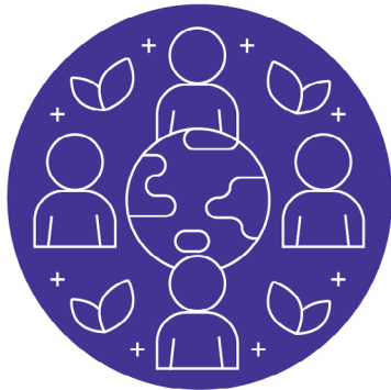
Community-wide commitment to promoting sustainable development